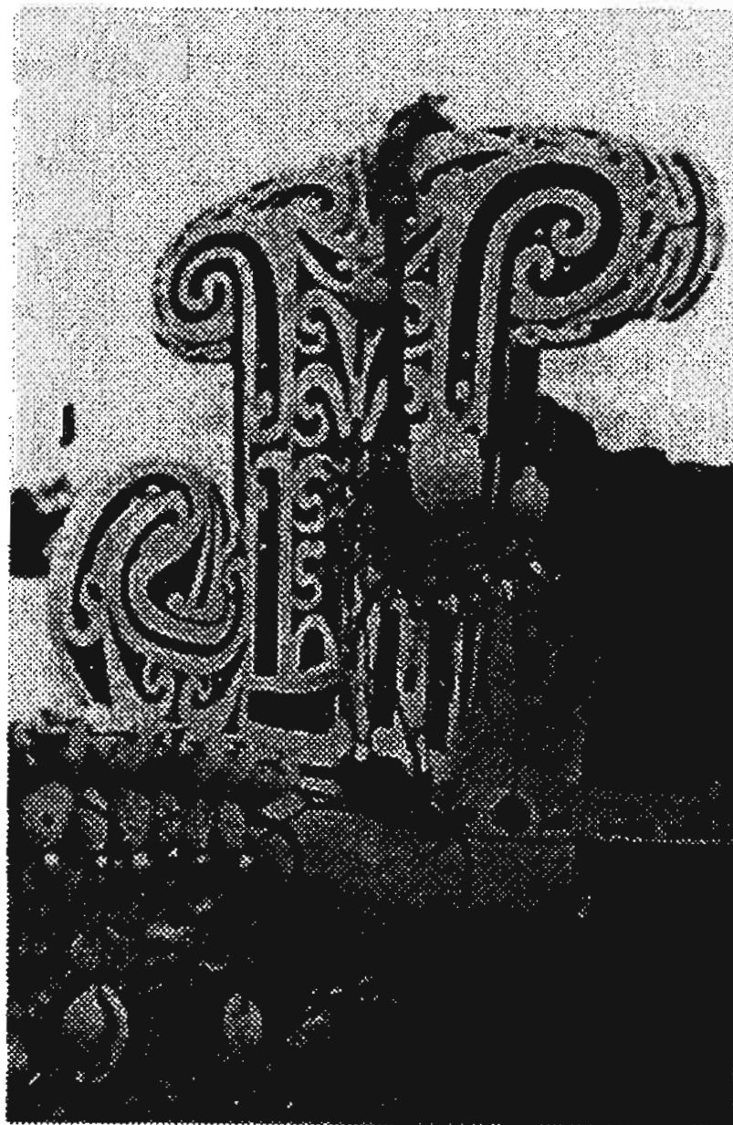
Figure 5.1 Trobriand canoe-prow, Kitava Island, Milne Bay Province, Papua New Guinea; photographer: Shirley F. Campbell, May 1977. The prow assembly is adorned with Kula shell valuables (see Campbell 1984).

Let me begin, however, by saying a little more about art as the technology of enchantment, rather than art as the enchantment of technology. There is an obvious prima-facie case for regarding a great deal of the art of the world as a means of thought-control. Sometimes art objects are explicitly intended to function as weapons in psychological warfare: as in the case of the canoe prow-board from the Trobriand Islands (Fig. 5.1) – surely a prototypical example of primitive art from the prototypical anthropological stamping-ground. The intention behind the placing of these prow-boards on Kula 2 canoes is to cause the overseas Kula partners of the Trobrianders, watching the arrival of the Kula flotilla from the shore, to take leave of their senses and offer more valuable shells or necklaces to