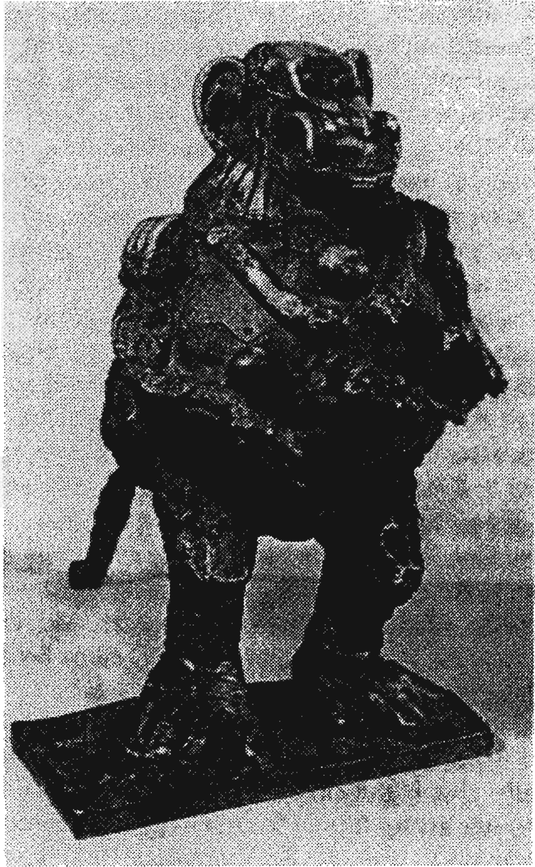
Figure 5.3 Pablo Picasso, Baboon and Young , 1950, Vallauris; bronze (cast 1955); 21\frac{1}{8} \times 14 \times 7\frac{3}{8} in. ( 53.6 \times 35.7 \times 18.8 cm); collection, The Museum of Modern Art, New York (Mrs Simon Guggenheim Fund). © Succession Picasso/DACS 1999

Duchamp's notorious urinal, by putting them in an art exhibition and providing them with a title ( Fountain ) and an author ('R. Mutt', alias M. Duchamp, 1917). Amikam Toren, one of the most ingenious contemporary artists, takes objects like chairs and teapots, grinds them up, and uses the resulting substances to create images of chairs and teapots. This is a less radical procedure than Duchamp's, which can be used effectively only once, but it is an equally apt means of directing our attention to the essential alchemy of art, which is to make what is not out of what is, and to make what is out of what is not.